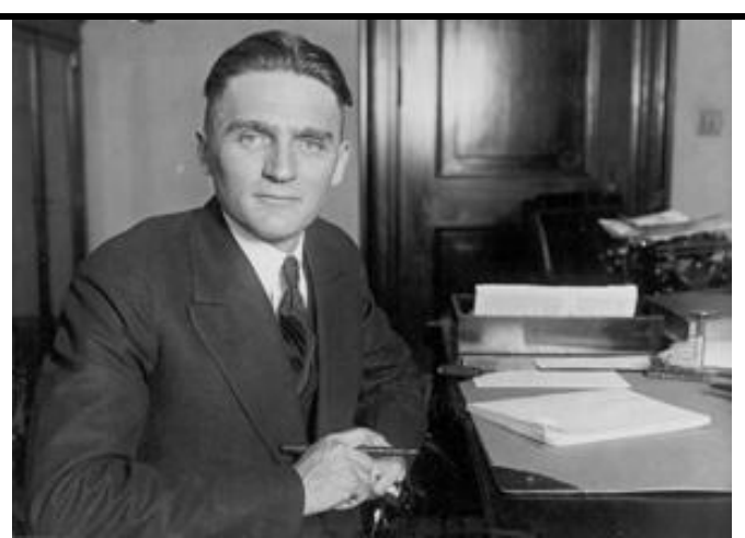
The role of Senator Gerald Nye

Herman Stern relied on U.S. Senator Gerald Nye for help when he needed immigration visas for his German relatives. Nye went to the Senate for North Dakota in the 1920s. He became known nationally in the 1930s for sponsoring neutrality laws that he hoped would keep the United States from becoming involved in any 'foreign wars.' Nye wrote letters to State Department officials, including the Secretary of State, asking them to 'clear the way' so that Stern's relatives could get the documents they needed to enter the United States. The State Department bowed to Nye's wishes.